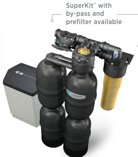
Model Shown: Q850

Platinum 10 Year Warranty: Enjoy years of dependability and peace of mind with one of the most comprehensive warranties in the industry.